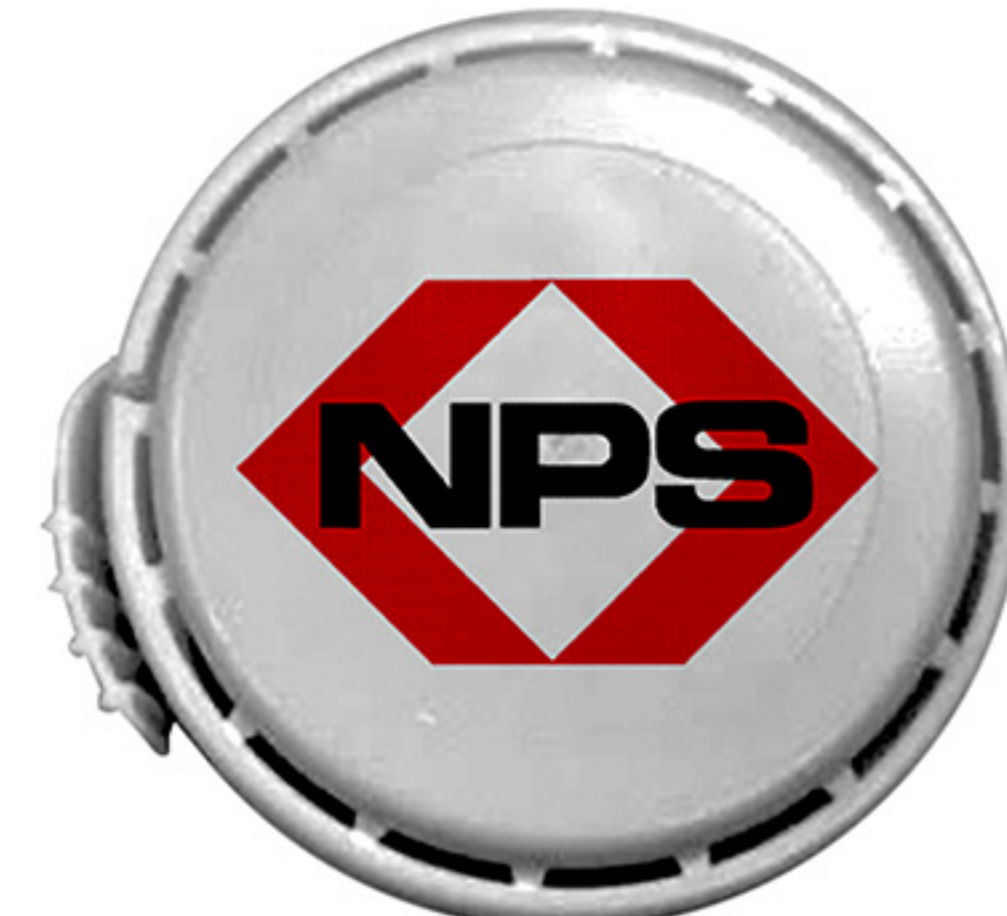
Tri Sure / Metal • T/E HDPE Snap Seal • NO Crimping Tool Required 2" NPS Code: #99TR002 • 3/4" NPS Code: #99TR001 (available w/ Company Logo)