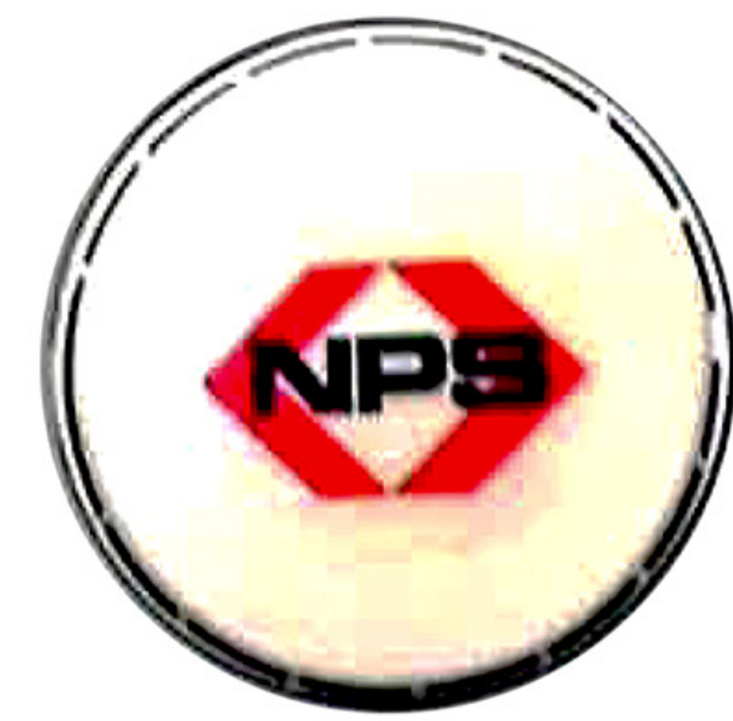
T/E Push-Lock Cap™ Seal • 15, 30 & 55 Gallon HDPE Drums • NO Crimping Tool Required NPS Code: #99T027 (Available w/ Company Logo)